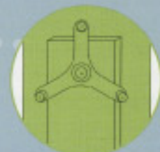
Chain Box Cover with Mechanical Assist Handle