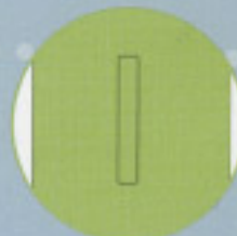
Hand Push Handle