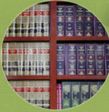
Unsurpassed strength for heavy media