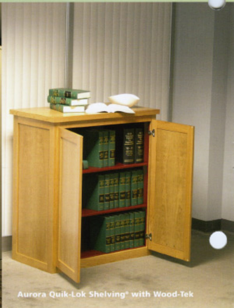
Aurora Quik-Lok Shelving® with Wood-Tek