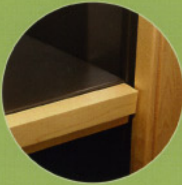
Unique blend of wood with steel shelving

Wood-Tek's classic good looks grace the hallways and front areas of business, legal and accounting firms, as well as libraries and schools across the country. Wood-Tek is not only beautiful, but strong enough to support the weight of the heaviest of media.