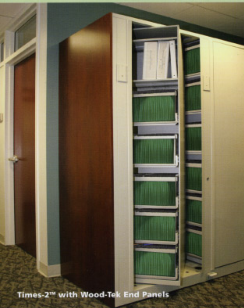
Times-2™ with Wood-Tek End Panels

Wood-Tek can be incorporated with many Aurora storage and filing products including Aurora Quik-Lok Shelving, Aurora Mobile and Times-2 Speed Files.