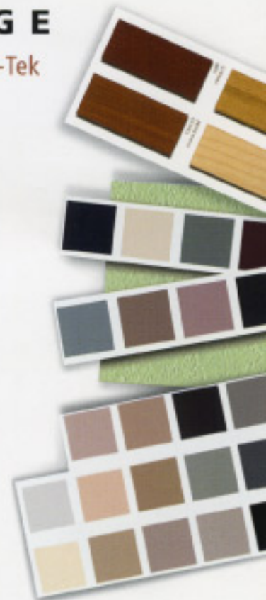
More colors, more design possibilities