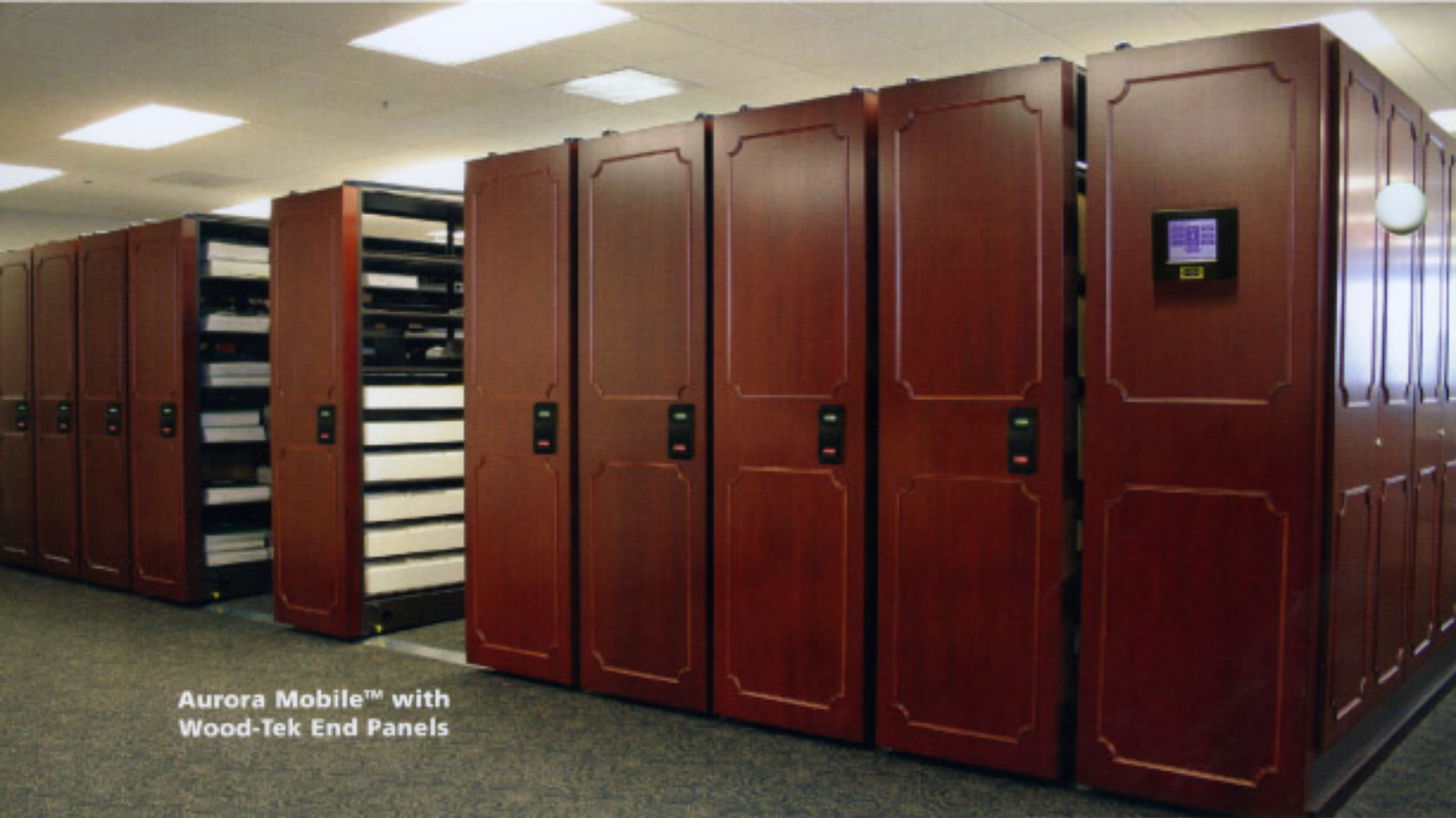
Aurora Mobile™ with Wood-Tek End Panels

Wood-Tek can be incorporated with many Aurora storage and filing products including Aurora Quik-Lok Shelving, Aurora Mobile and Times-2 Speed Files.