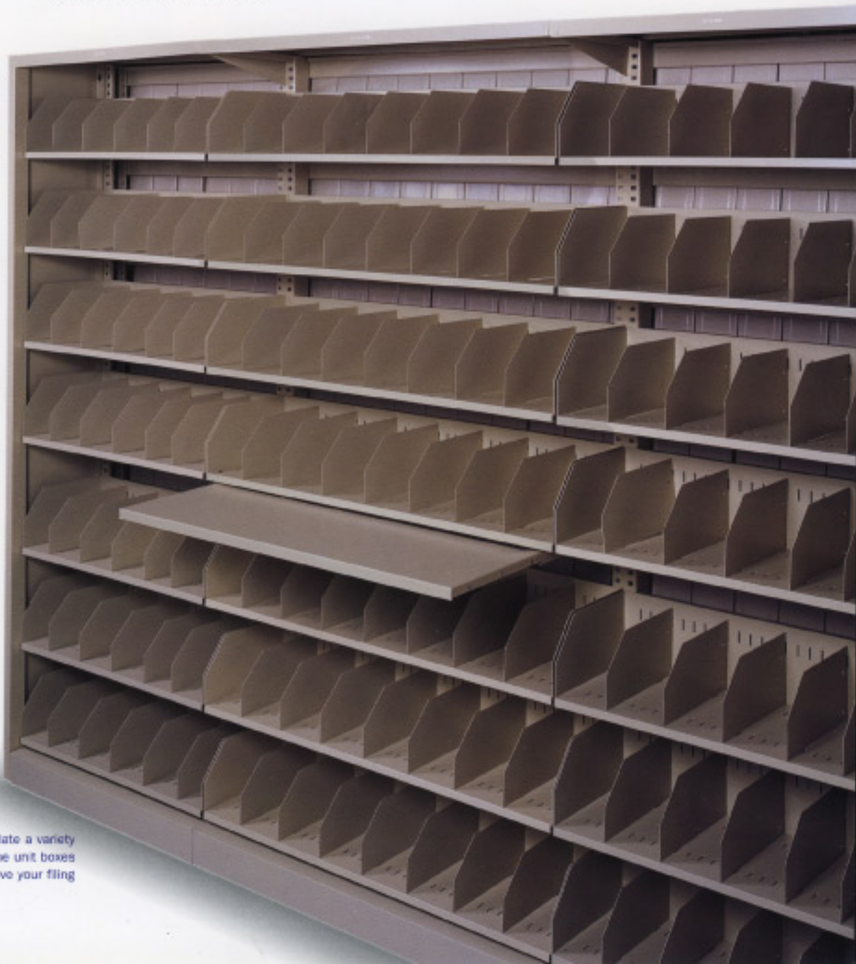
Steel shelves accommodate a variety of media. You can combine unit boxes with steel shelves to serve your filing and storage needs.

Custom design a system with unit boxes to house file folders and flat steel shelves for larger documents. Sturdy dividers are adjustable at 1" increments. You simply place the dividers where needed, and they lock into place using three attaching points. And, retractable work shelves are an option to greatly increase productivity by offering an immediate work surface.