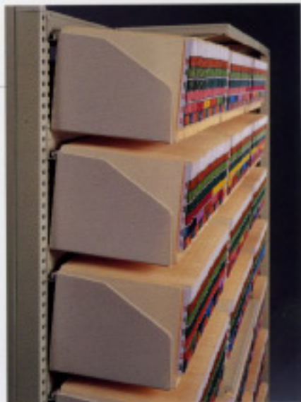
The downward 5-degree tilt creates a unique stair-step design. The files project into the light for better visibility. And, the generous spacing between rows makes the folders easy to access.

Unit File Systems use a sturdy steel frame. Vertical posts are L-shaped for single-faced and T-shaped for double-faced configurations. The rails connect to the posts horizontally, which hold the hanging boxes. The equipment goes together quickly and efficiently — assembly does not require fasteners! And, these systems can be taken apart easily. Your records can remain intact within the plastic boxes, and this makes moving far less disruptive.