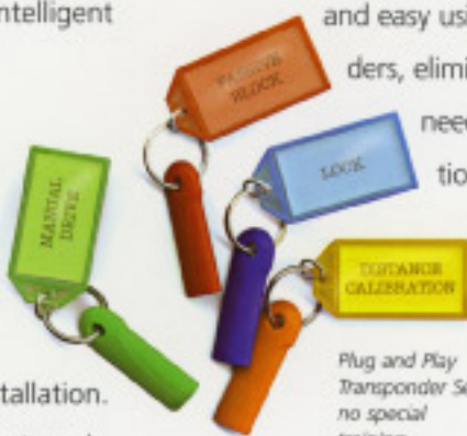
Plug and Play Transponder Set Up — no special training required

and easy using transponders, eliminating the need for calibration charts and expensive equipment.