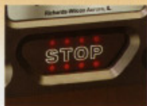
Red Steady LEDs mean the Passive Block Safety System is activated.

system is passive (PBS - Passive Block System), requiring no activation by the user. Once an aisle opens, the system activates and remains in force, restricting carriage movement