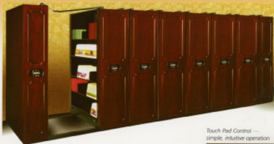
Touch Pad Control — simple, intuitive operation

Power 3 contains an intelligent controller that features plug and play installation. Optional logic allows for external control of system functionality and interfaces with environmental systems including security, fire alarm, surveillance, HVAC, and lighting.